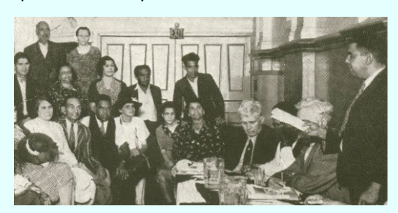
Section of meeting organised by AAPA

It was noted in press coverage that pleas were entered for direct representation in parliament.